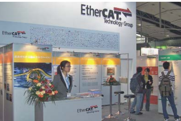
SIAF in Guangzhou

EtherCAT does not need switches, the master is implemented in software on standard Ethernet ports and inexpensive chips are available for slave devices. EtherCAT is thus ideally suited for internal (Embedded) applications in devices where CAN or serial interfaces reach the limits of their performance. For this reason the ETG exhibited at the Embedded World in Nuremberg, Germany – and met with great interest there: besides many new customers, several developers from ETG members also visited the booth and took the opportunity to “talk shop” with the EtherCAT experts.