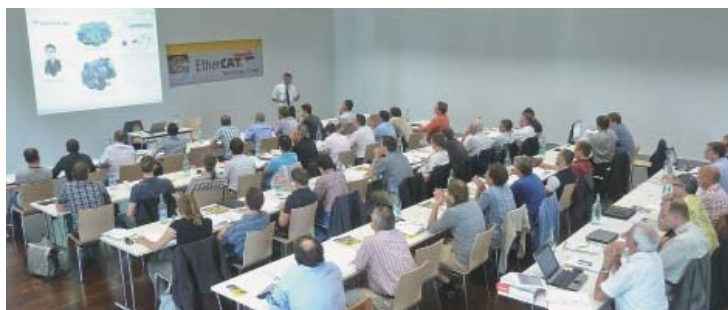
The ETG seminars in Great Britain (above) and Switzerland (below)